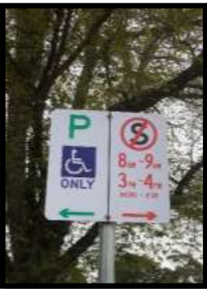
New signage is currently being installed