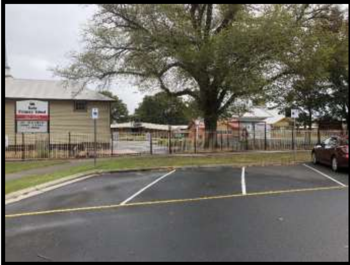
These 3 spaces will be combined and made into 2 disabled car parking spaces

The Wellington Shire will be patrolling this area throughout the year to ensure that only vehicles with a disabled sticker are parked in these spaces.