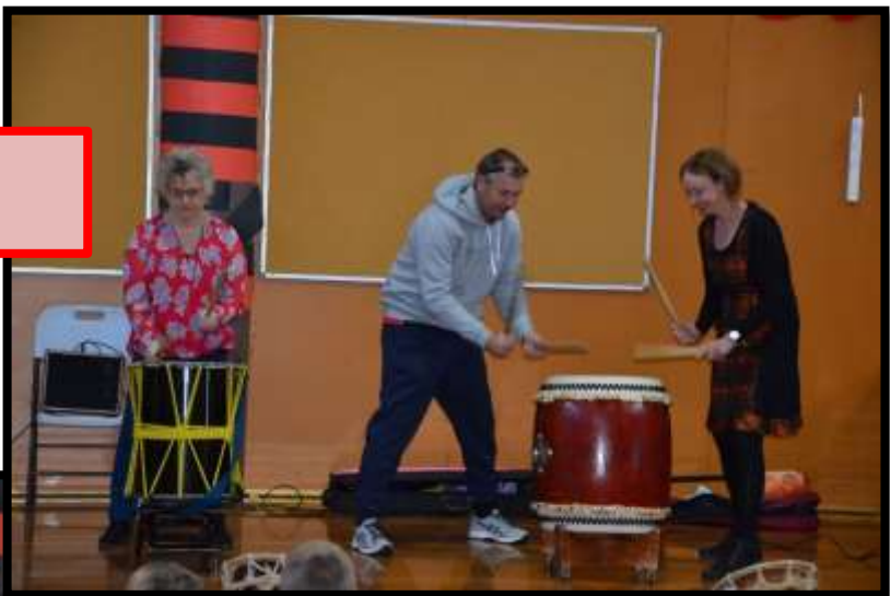
WA-SA-BI Taiko Incursion held last Thursday