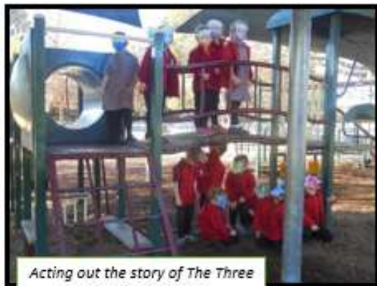
Acting out the story of The Three Billy Goats Gruff

At Sale Primary School, we have developed a program that specifically builds on the individual needs of children who may not yet be ready for the more formal classroom schooling experience.