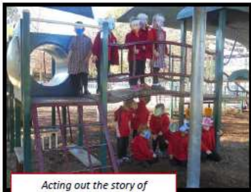
Acting out the story of The Three Billy Goats Gruff

At Sale Primary School, we have developed a program that specifically builds on the individual needs of children who may not yet be ready for the more formal classroom schooling experience.