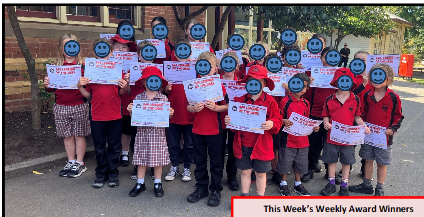
This Week's Weekly Award Winners