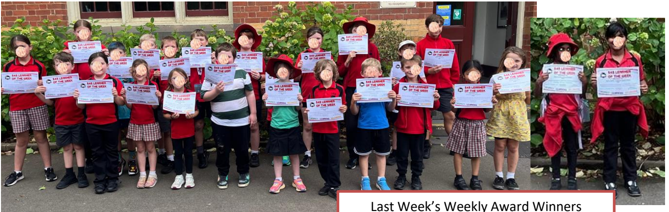
Last Week's Weekly Award Winners