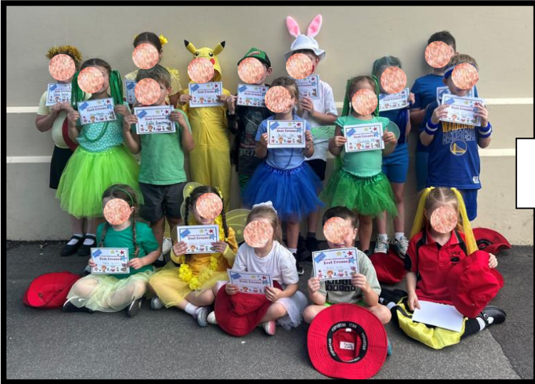
Junior School Students Best Dressed House Colours Winners