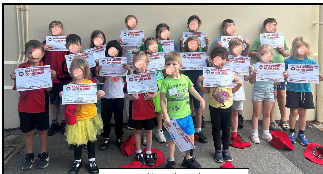
Last Week's Weekly Award Winners