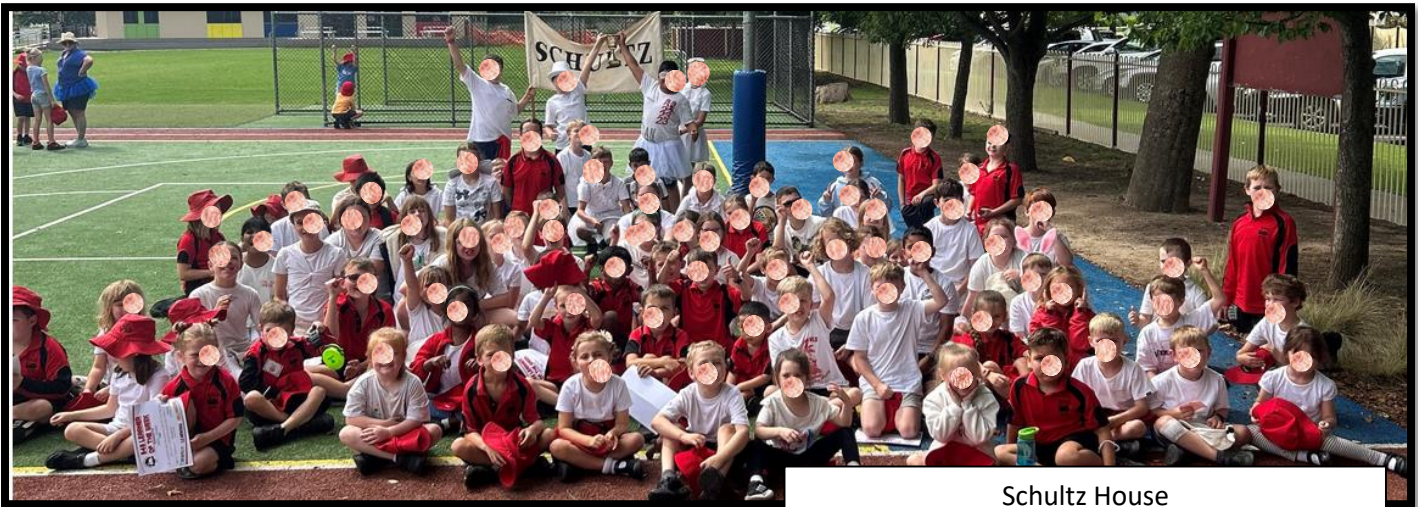
Schultz House Winners of the 545 House Swimming Carnival Spirit Cup