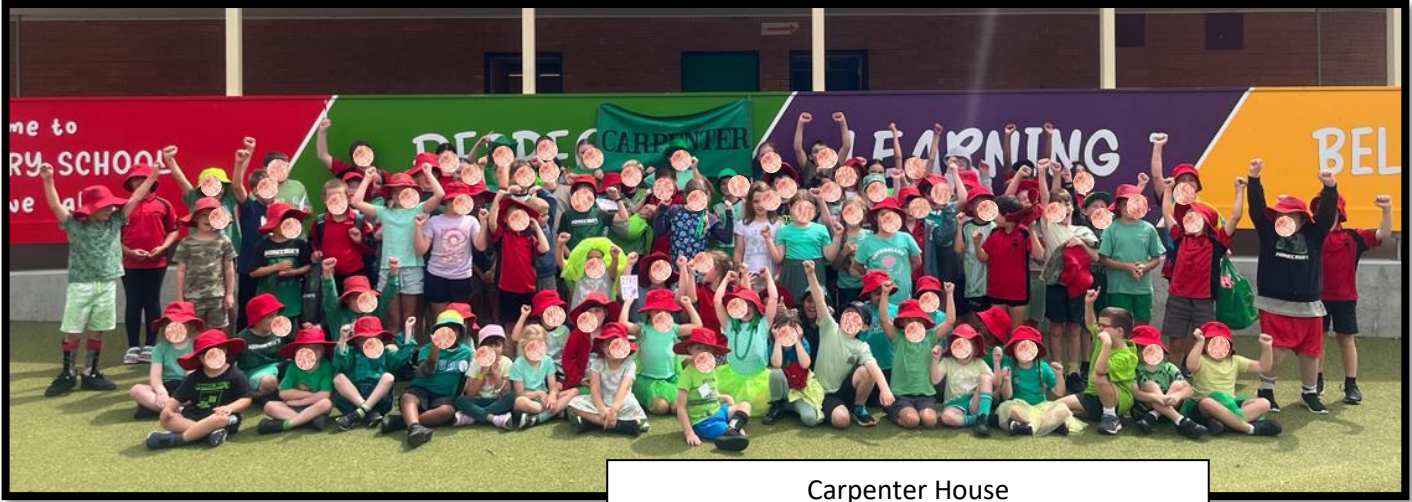
Carpenter House Winners of the 545 House Swimming Carnival