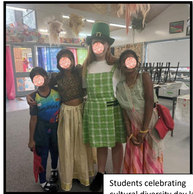
Students celebrating cultural diversity day last Thursday

The signs were delivered to school today and will be displayed in prominent locations for all to see.