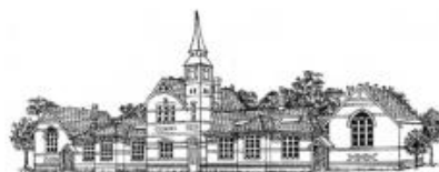
SALE PRIMARY SCHOOL No. 545